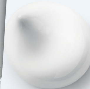
Rich and creamy texture