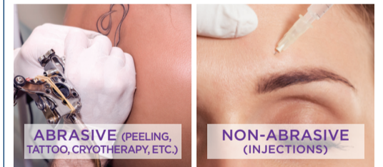
ABRASIVE (PEELING, TATTOO, CRYOTHERAPY, ETC.)